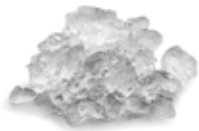
MF 57 Superflake ice Residual water content 15%