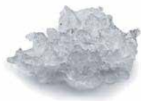
MF 37 Flake ice Residual water content 25%