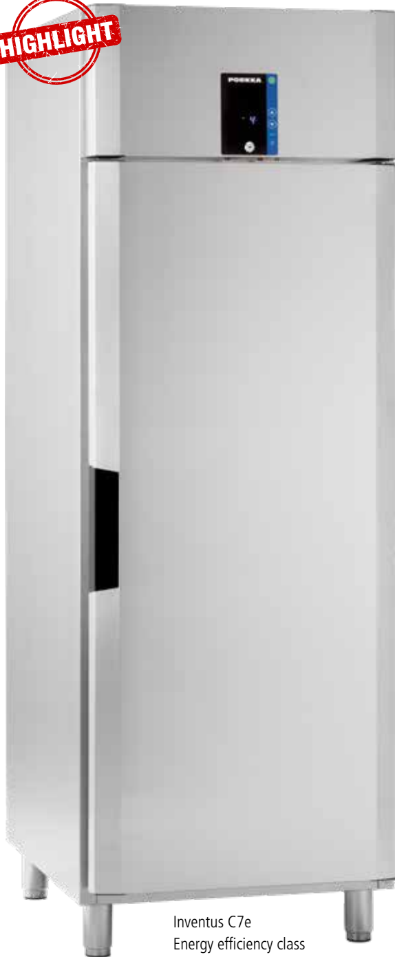
Inventus C7e Energy efficiency class