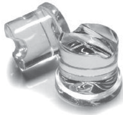
B 5022 AS / WS

Also available in the self-contained range for "Bistrot" cube: B 2006, B 2508, B 3008, B 3015, B 4015, B 6022, B 7540, B 9040, B 9550 See pertaining literature for more details