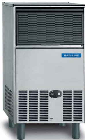
B 5022 AS/WS

Bar Line Equipment range is the newly released EU made ice makers for Thimble-shaped rounded ice cubes coming from Bar Line. Built in the Italian manufacturing plant of Frimont Spa, ISO 9001 Certified, these units are built with sturdy, corrosion resistant stainless steel, and feature European made componentry to assure maximum quality and reliability. Tested one by one, the Bar Line self contained units feature well balanced ratio between production and storage capacity, alongside with reduced outer dimensions that allow for built-in installations. Front air louvers assure appropriate airflow in critical install requirements. Contemporary, elegant design unites excellent operational features with the reliability obtained through years of successful experience in ice making technology. Insulated bin door and ice storage bin minimize air condensation and water formation on equipment surfaces. Electromechanic controls maximise reliability and ease of repair during the entire life of the equipment. Proudly Made in Italy.